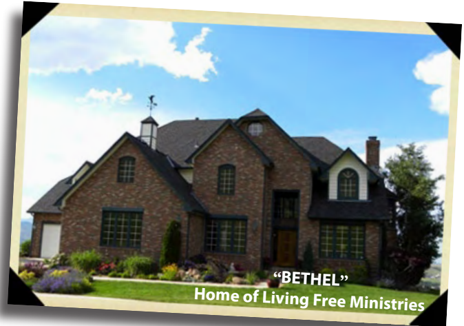
a Sanctuary of Love & Healing

For more information on these dates, please log onto our website or pick up a flyer while up at Bethel. If you have questions you can always call the ministry line at 303-421-6865 ext. 1 or email nancy@livingfreeministries.com .