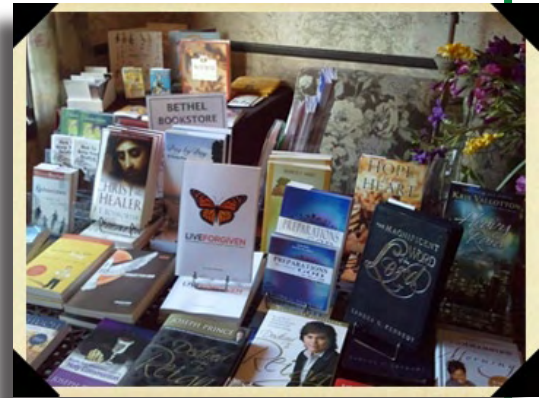
The Bethel Bookstore is open during all LFM ministry times, classes and events!